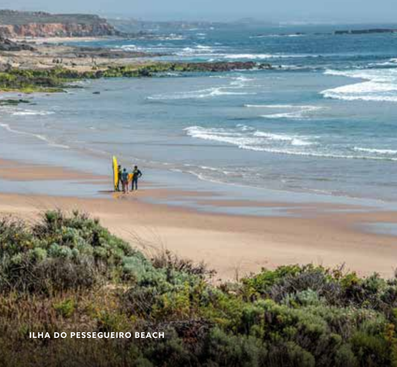
ILHA DO PESSEGUEIRO BEACH