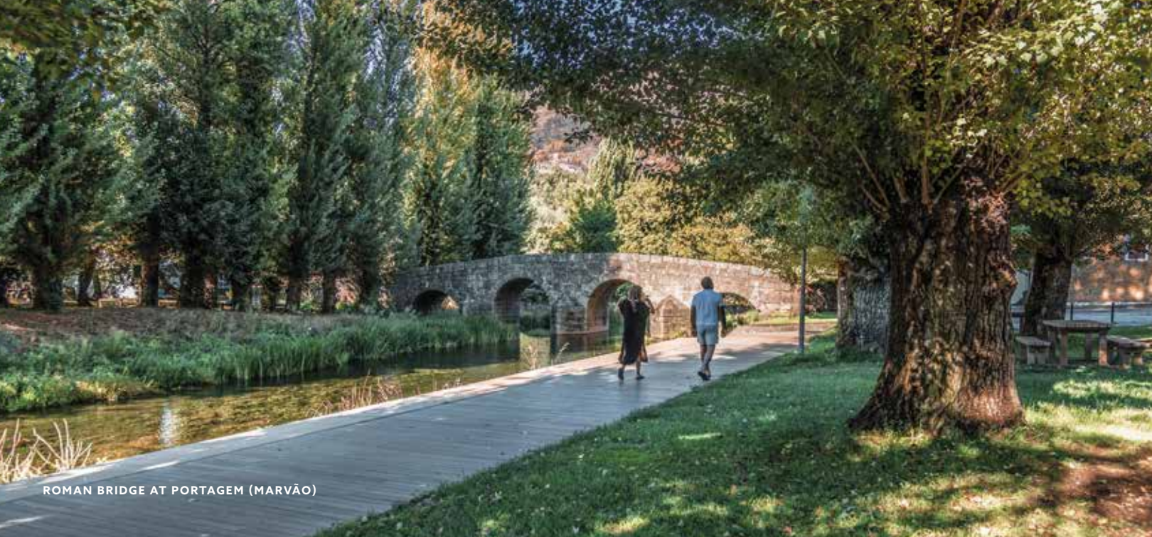
ROMAN BRIDGE AT PORTAGEM (MARVÃO)