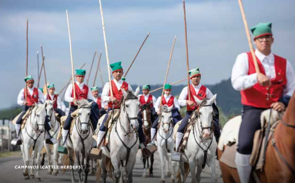
CAMPINOS (CATTLE HERDERS)