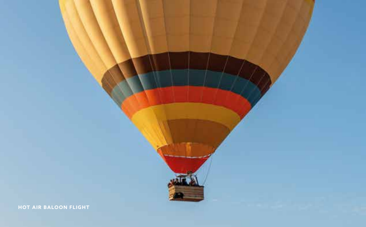
HOT AIR BALOON FLIGHT