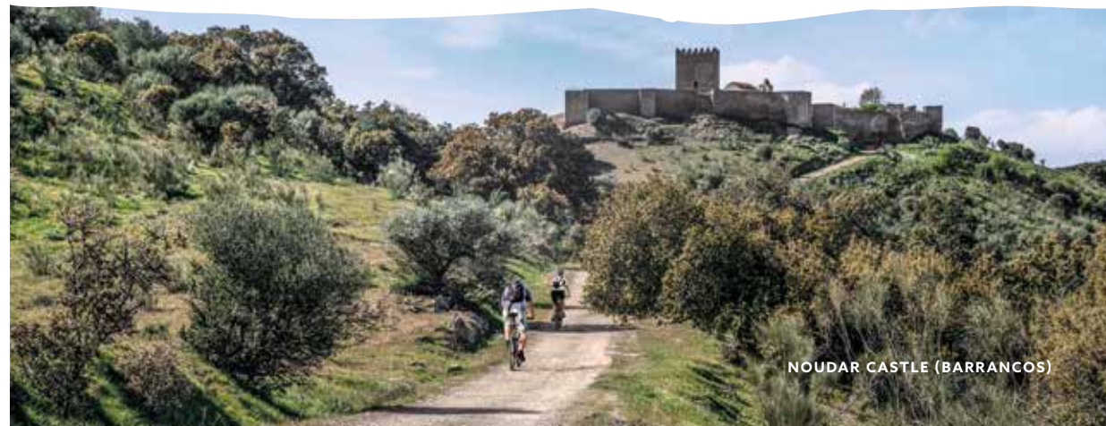
NOUDAR CASTLE (BARRANCOS)

But if you can't resist the mix of dust, mud and adrenaline, Serpa has a mountain bike center with nearly 100 miles of marked trails along wild borderlands.