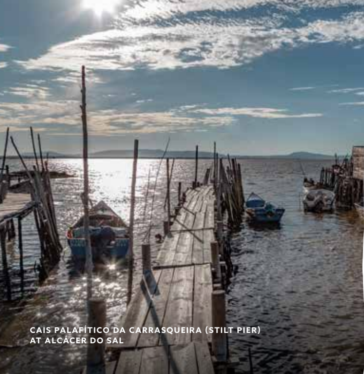
CAIS PALAFÍTICO DA CARRASQUEIRA (STILT PIER) AT ALCÁCER DO SAL