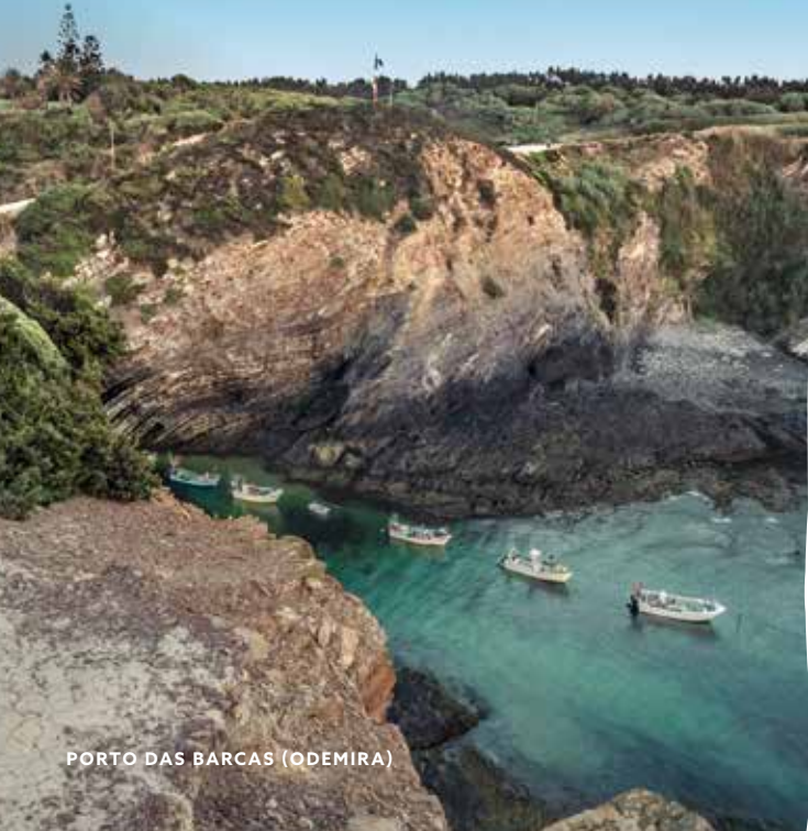
PORTO DAS BARCAS (ODEMIRA)