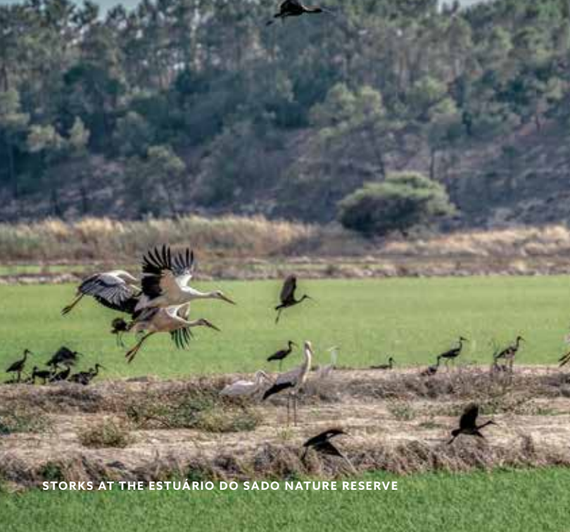
STORKS AT THE ESTUÁRIO DO SADO NATURE RESERVE