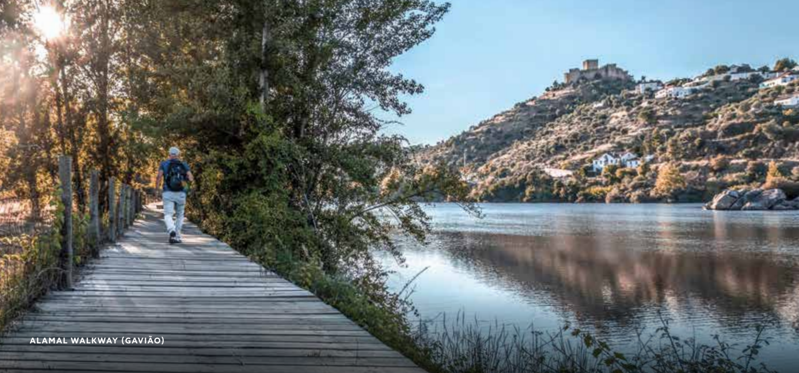
ALAMAL WALKWAY (GAVIÃO)